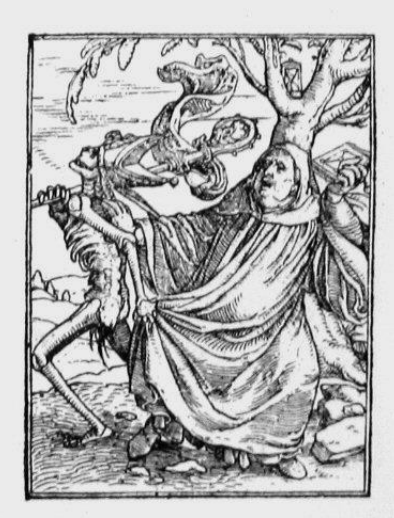
Il'mourra,Car il n'a receu En foy aulcune difcipline, Et au nombre fera deceu De folie qui le domine.