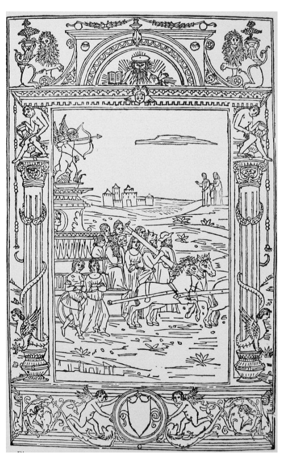
Figure 38 The Triumph of Love from Petrarch's Trionfi of 1492.

The plague affected the sensibility of the survivors for generations to come. A parallel